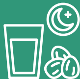
Iftar / Dinner