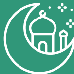
Ramadan Ration Distribution