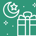
Kids Eid Gifts